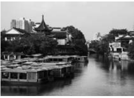
Fig. 1 for Question 1

Nanjing, a city in eastern China, has been selected to host the second summer Youth Olympic Games (YOG) in August 2014. Nanjing has the advanced infrastructure and transport network necessary to meet the needs of the Games, a major sports tourism event.